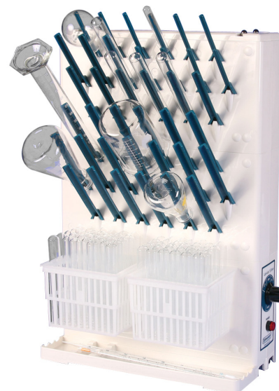
Benchtop - Electric Single-sided, 3 tier