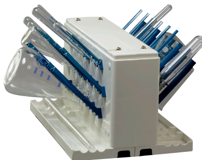
Benchtop - Non-electric Double-sided, 1 tier