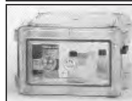
Secador™ 1.0 Volume .75 cubic feet